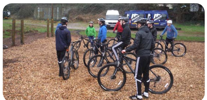
Group 2 mountain bike safety