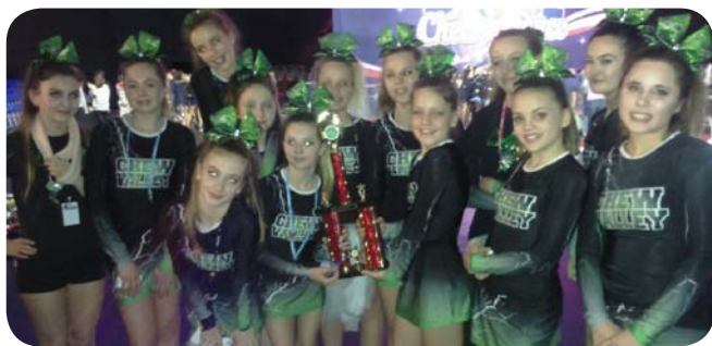
'Storm' crowned champions

The two cheerleading squads have been working really hard since September on their competition routines and they have been joined by a third squad who have produced a brilliant team stunt routine. All three teams competed in the BCA South West event in Exeter at the end of February. The performances were fantastic and really reflected the trust and team work that the cheerleaders need for their routines to work. Our Level 2 team 'Storm' were crowned champions, the group stunt team 'Cyclones' were placed second and the youngest team 'Lightning' were placed 6th.