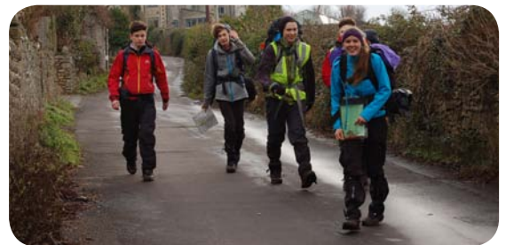
Ten Tors 45 mile training walk

Ten Tors training is well underway. The students have been attending briefing sessions on a Thursday lunchtime, which are often delivered by the Year 13 Expedition Leaders group. We had a cold but successful day walk on the Mendips at the beginning of February and 45 students are looking forward to the first overnight training on Dartmoor at the beginning of March.