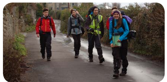
Ten Tors 45 mile training walk

Ten Tors training is well underway. The students have been attending briefing sessions on a Thursday lunchtime, which are often delivered by the Year 13 Expedition Leaders group. We had a cold but successful day walk on the Mendips at the beginning of February and 45 students are looking forward to the first overnight training on Dartmoor at the beginning of March.