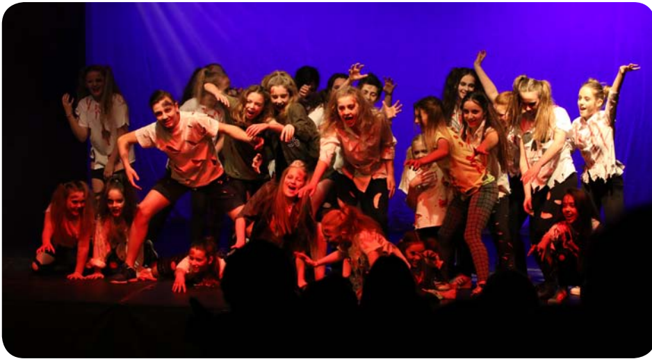
Street Dance Club Performing 'Thriller'.