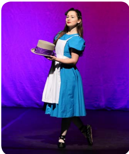
CVDC performing 'Alice in Wonderland'.