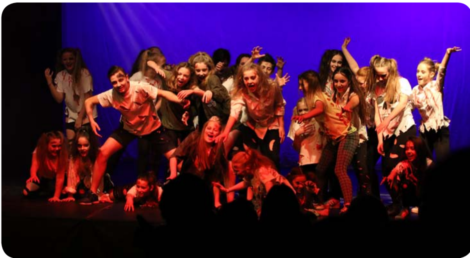
Street Dance Club Performing 'Thriller'.