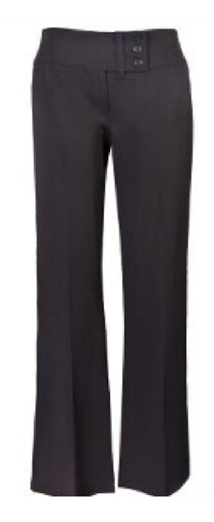
Boot Legged Trousers