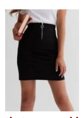
Skirts that are considered to be too short will be challenged